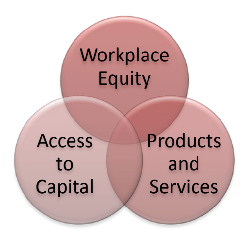
Exhibit II: Common Investment Gender Lenses

The Crittenton Institute in their paper, "State of the Field of Gender Lens Investing," outlined three basic gender lenses commonly applied in investing to address some of the gender disparities outlined above: Access to Capital, Workplace Equity, and Products and Services.